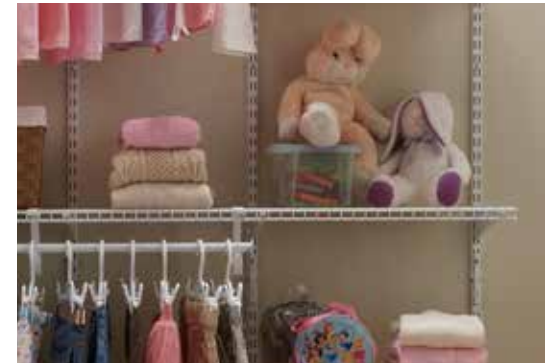
SuperSlide® — ShelfTrack™