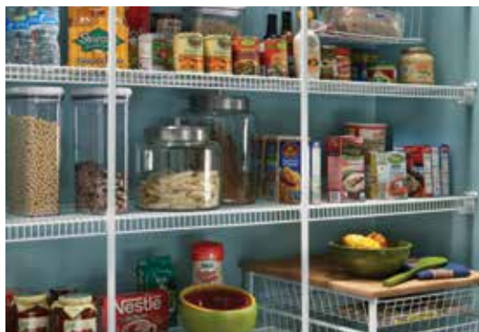
Close Mesh — Fixed Mount