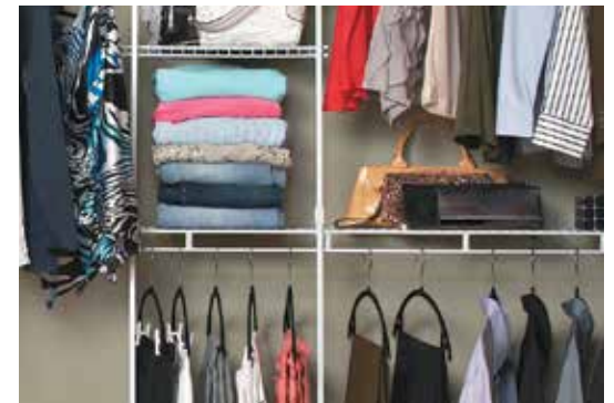
Shelf & Rod