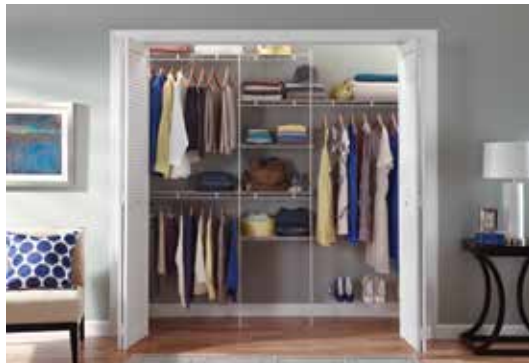
Shelf & Rod — Fixed Mount