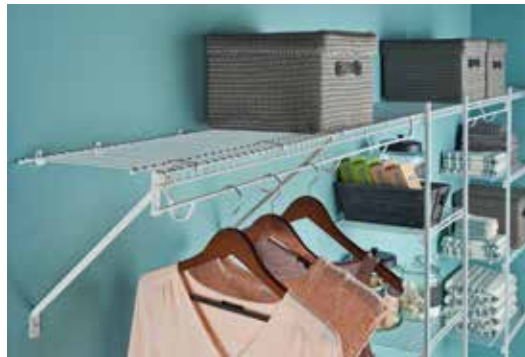
TotalSlide® Pro — Fixed Mount