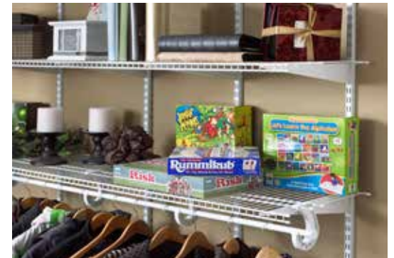
SuperSlide® — ShelfTrack™