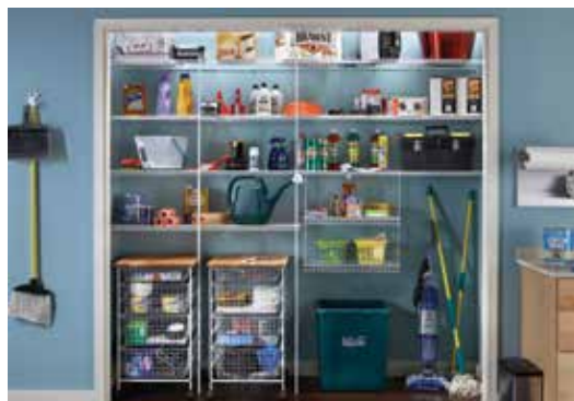
All-Purpose — Fixed Mount